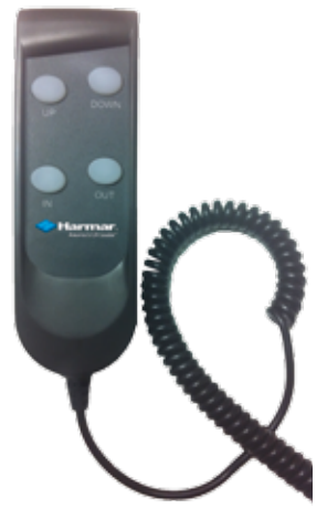
Refined Hand Control