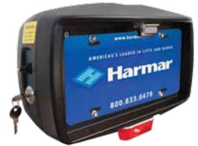
AL010/050 & AL030 One Switch Operation, Key lock & Courtesy Light