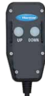
AL055 & AL065 Remote Hand Control