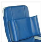
Torso Support TS00