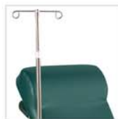
IV Pole IV