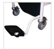
Flip-up Footrests FS00