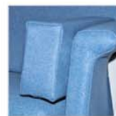
Side Cushion SC00