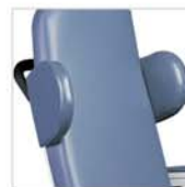
Lateral Support LS00