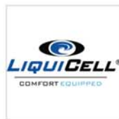
LiquiCell LC (5251/5261) ONLY