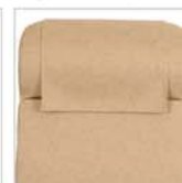
Headrest Cover HX00