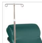
IV Pole IV