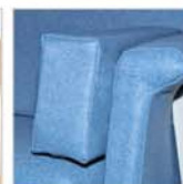
Side Cushion SC00