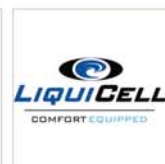
LiquiCell LC (5291 ONLY)