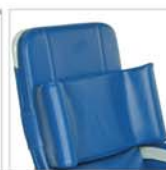
Torso Support T500