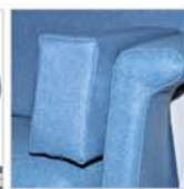
Side Cushion SC00