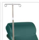
IV Pole IV