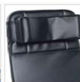
Contoured Headrest CH00