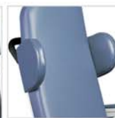
Lateral Support L500