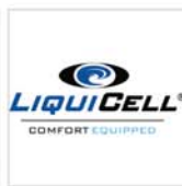
LiquiCell LC (5851/5861 ONLY)