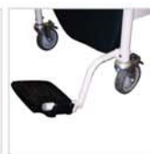
Flip-up Footrests F500