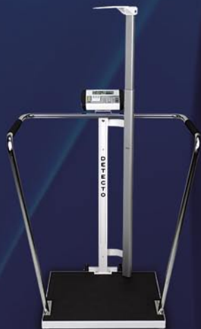
DETECTO Model 6857DHR