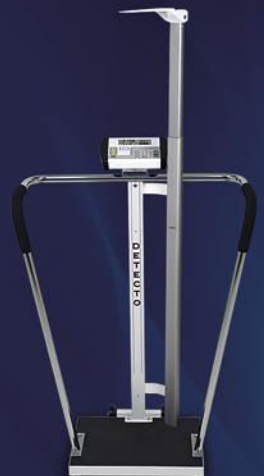
DETECTO Model 6854DHR

Detecto Scale reserves the right to improve, enhance, or modify features and specifications without prior notice.