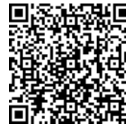
GP Web Page

*Download a QR reader to your Smartphone to access the additional information section