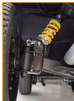
Four-wheel independent suspension standard