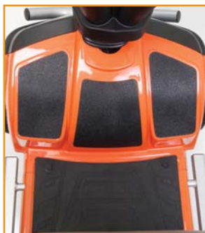
Floor deck features rugged rubber mat and anti-skid material