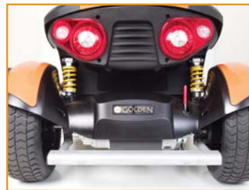
Full front and rear lighting package standard