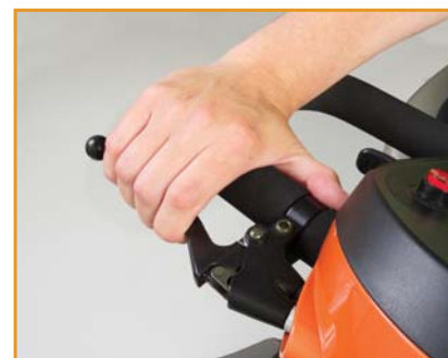
Hand brake standard