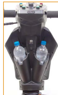
Water bottle holders for cold beverage bottles only. Removable for easy cleaning.