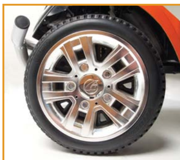
Black, low profile, non-marking solid tires with chrome hubcaps standard