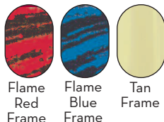
Flame Red Frame