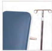
ADDITIONAL IV Pole IV