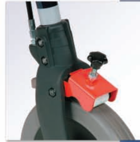
SLOW DOWN BRAKE