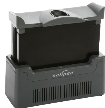
Desktop Charger PN #7112-SEQ