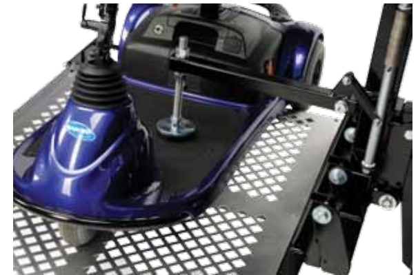
Automatic Hold-down Foot