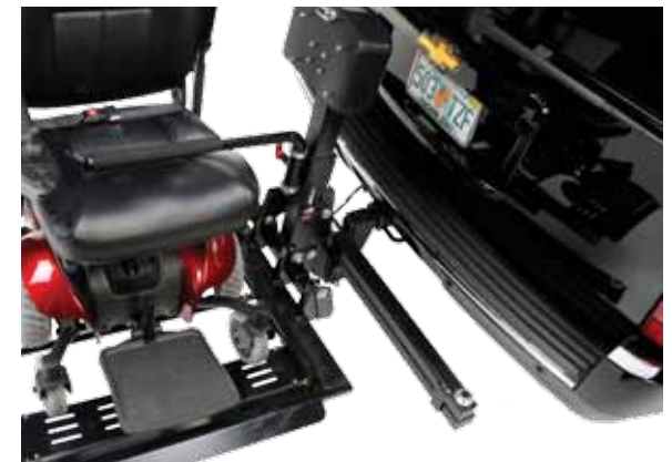
Automatic Hold-down Arm