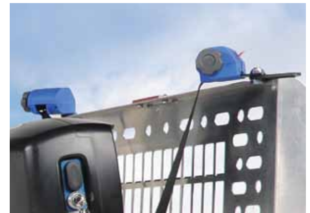
Q'Straint Retractable Hooks