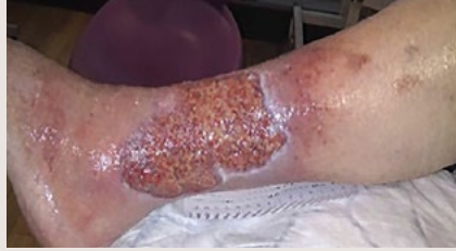
Week 6 – after addition of WoundExpress therapy - 91.3 cm 2