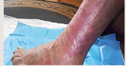
Week 16 – after addition of WoundExpress therapy - Healed