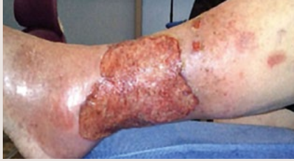
Week 0 – 252 cm 2 (circumferential wound)

HISTORY – 87 year old female with 5 month history of venous leg ulcer with rapid deterioration. Unable to tolerate static compression therapy due to pain – hence she was receiving light static compression only.